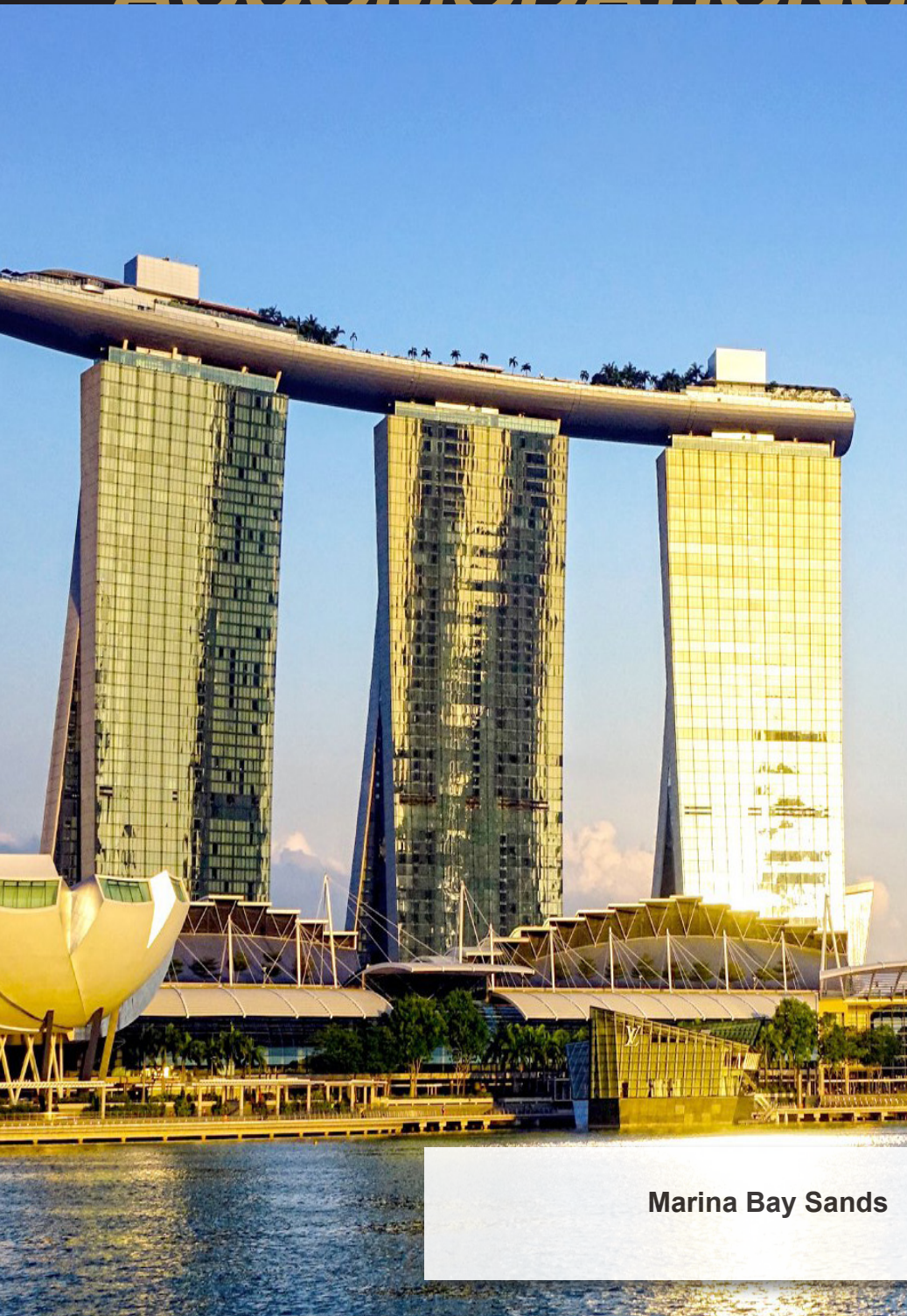
Marina Bay Sands