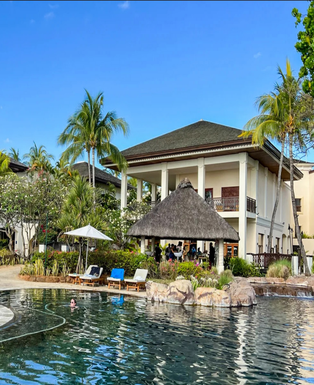
HILTON MAURITIUS RESORT & SPA