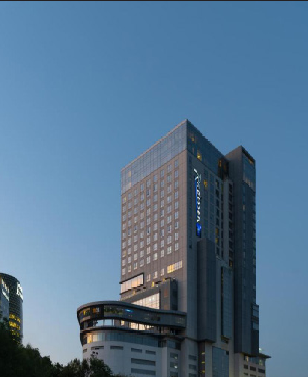
RADISSON BLU SANDTON