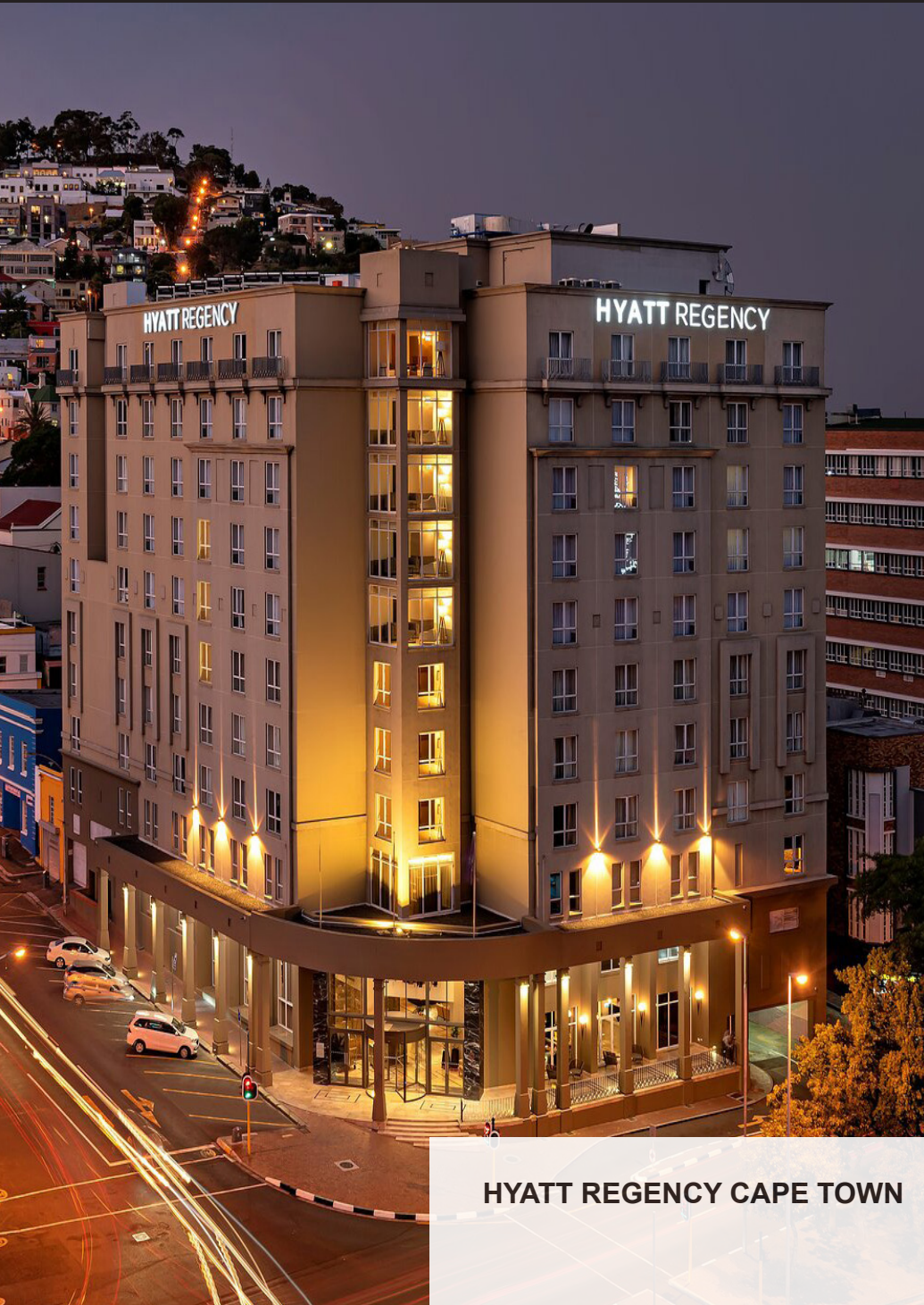
HYATT REGENCY CAPE TOWN