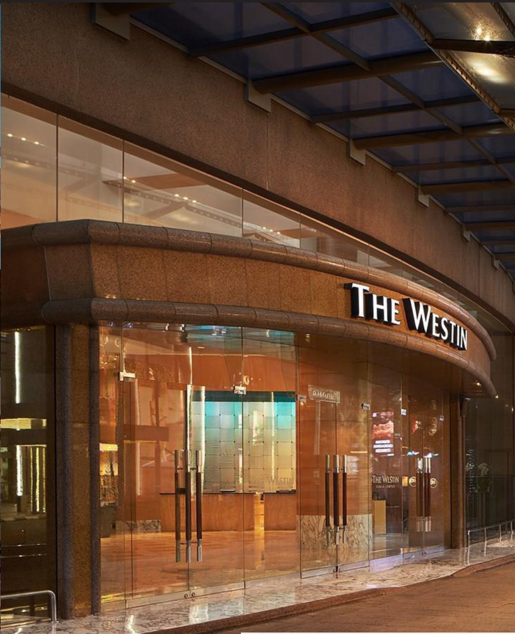
The Westin Kuala Lumpur