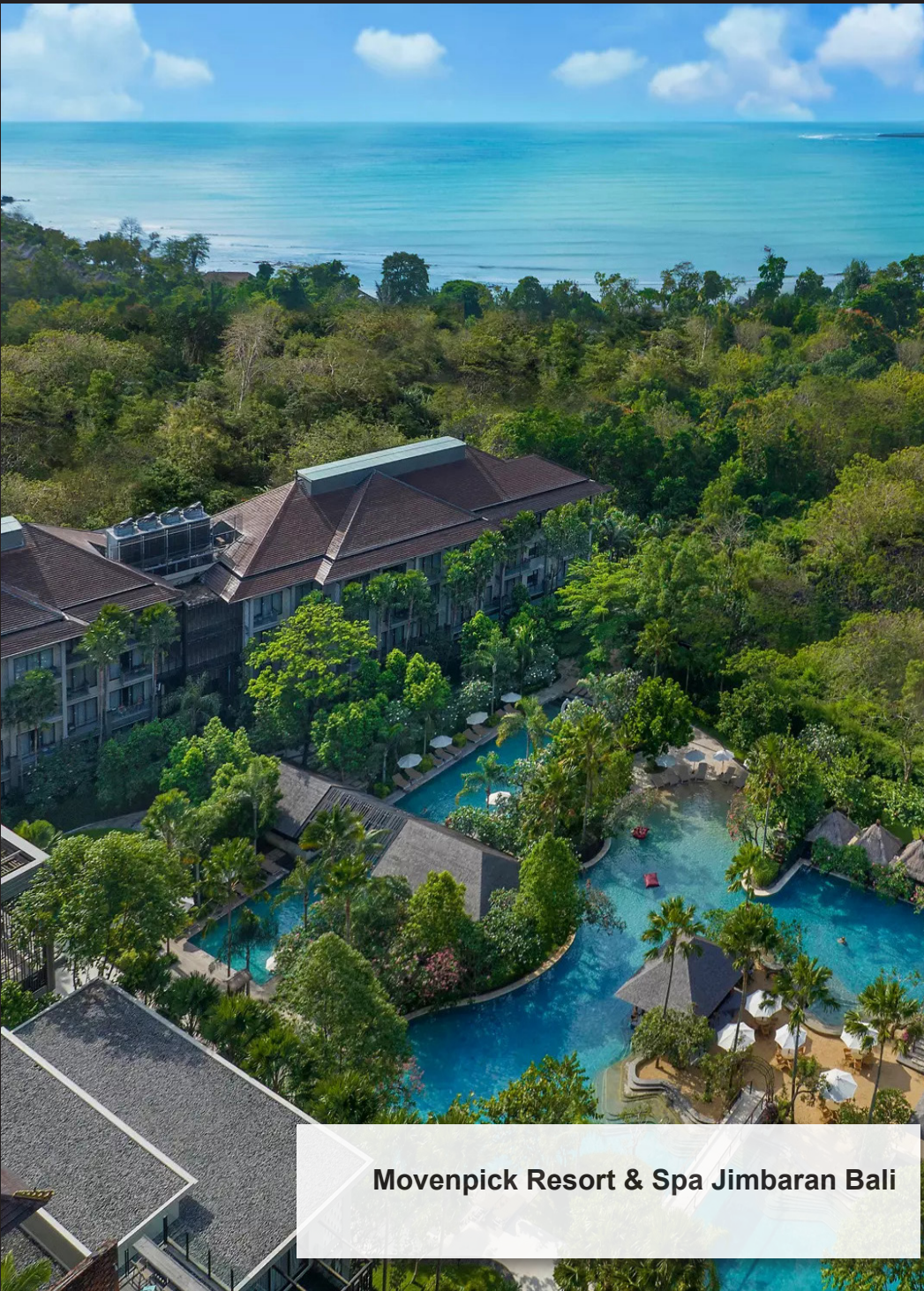
Movenpick Resort & Spa Jimbaran Bali