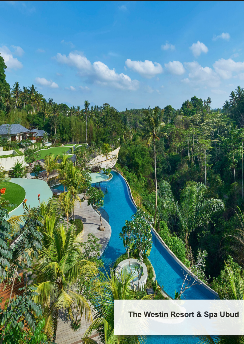
The Westin Resort & Spa Ubud