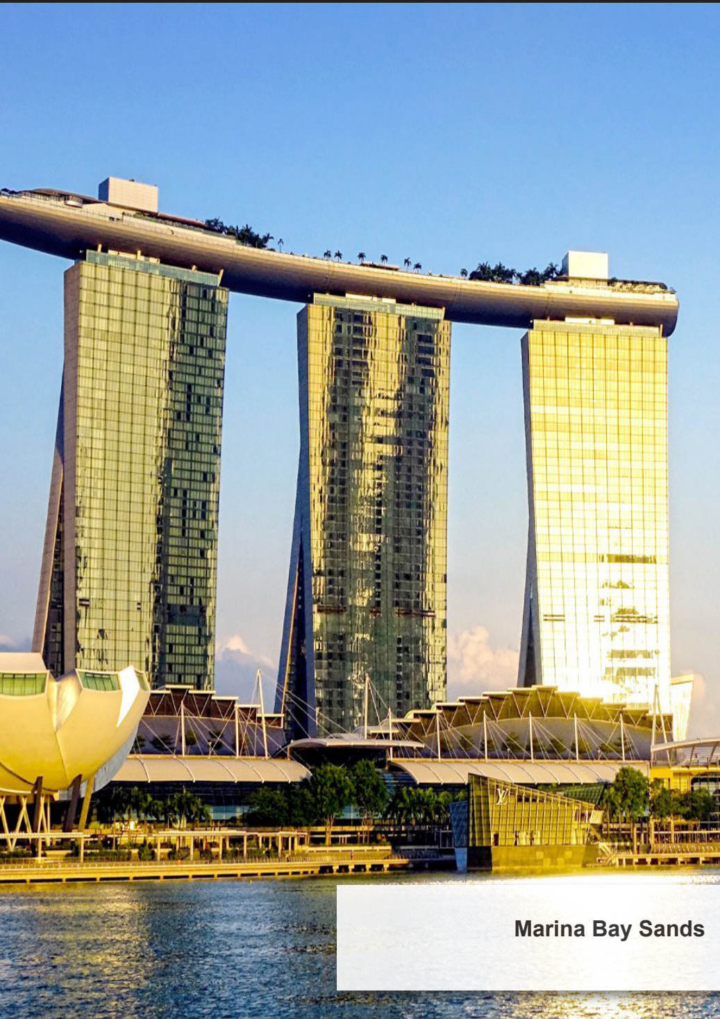
Marina Bay Sands