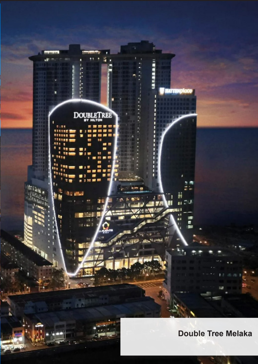
Double Tree Melaka