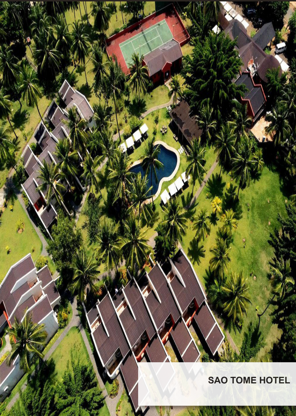
SAO TOME HOTEL