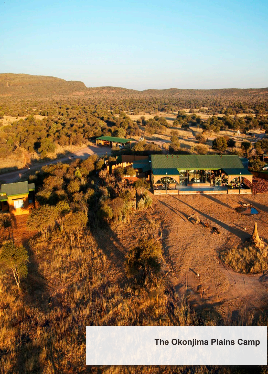
The Okonjima Plains Camp