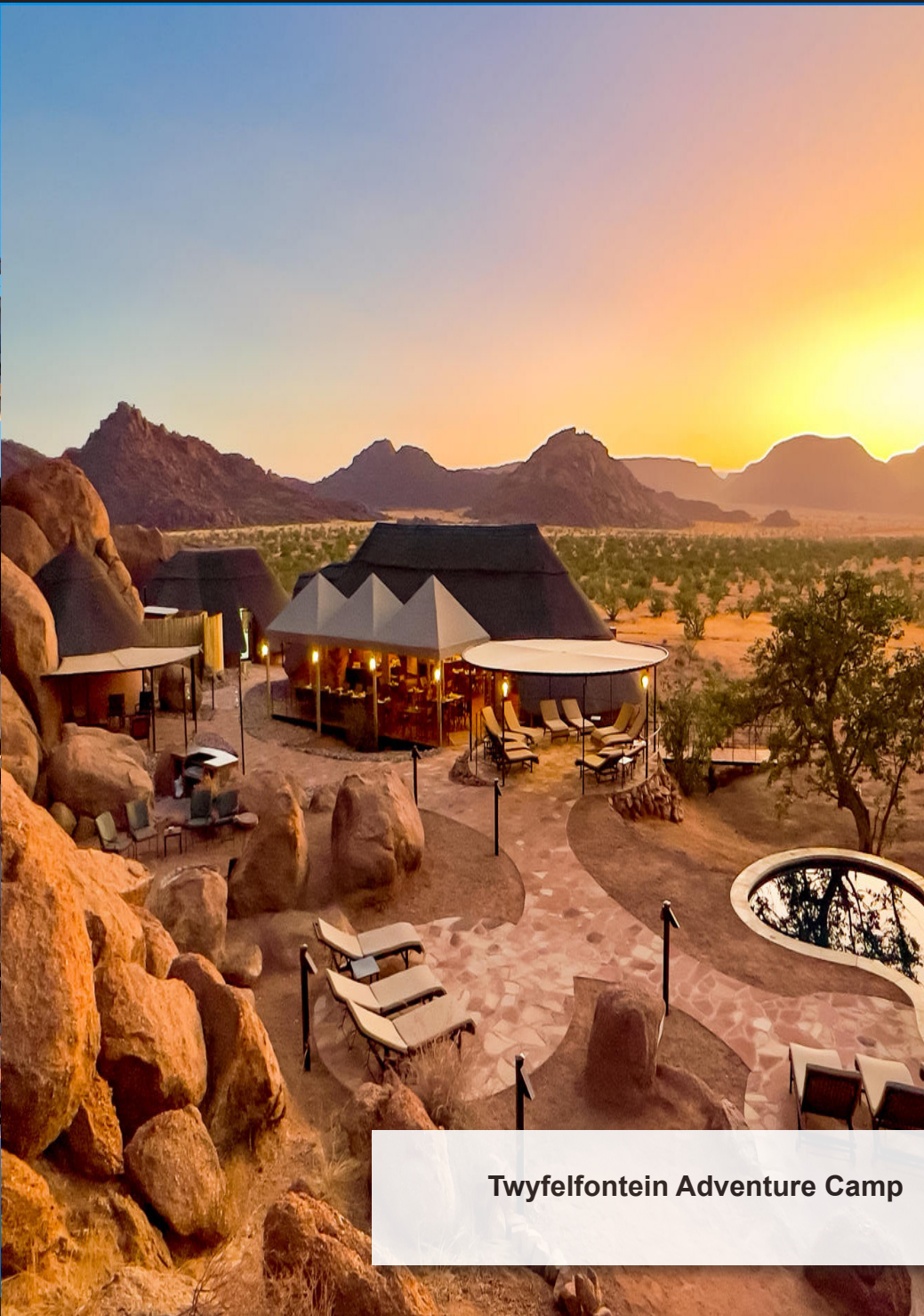
Twyfelfontein Adventure Camp