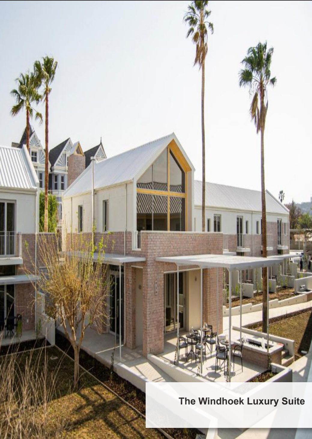
The Windhoek Luxury Suite