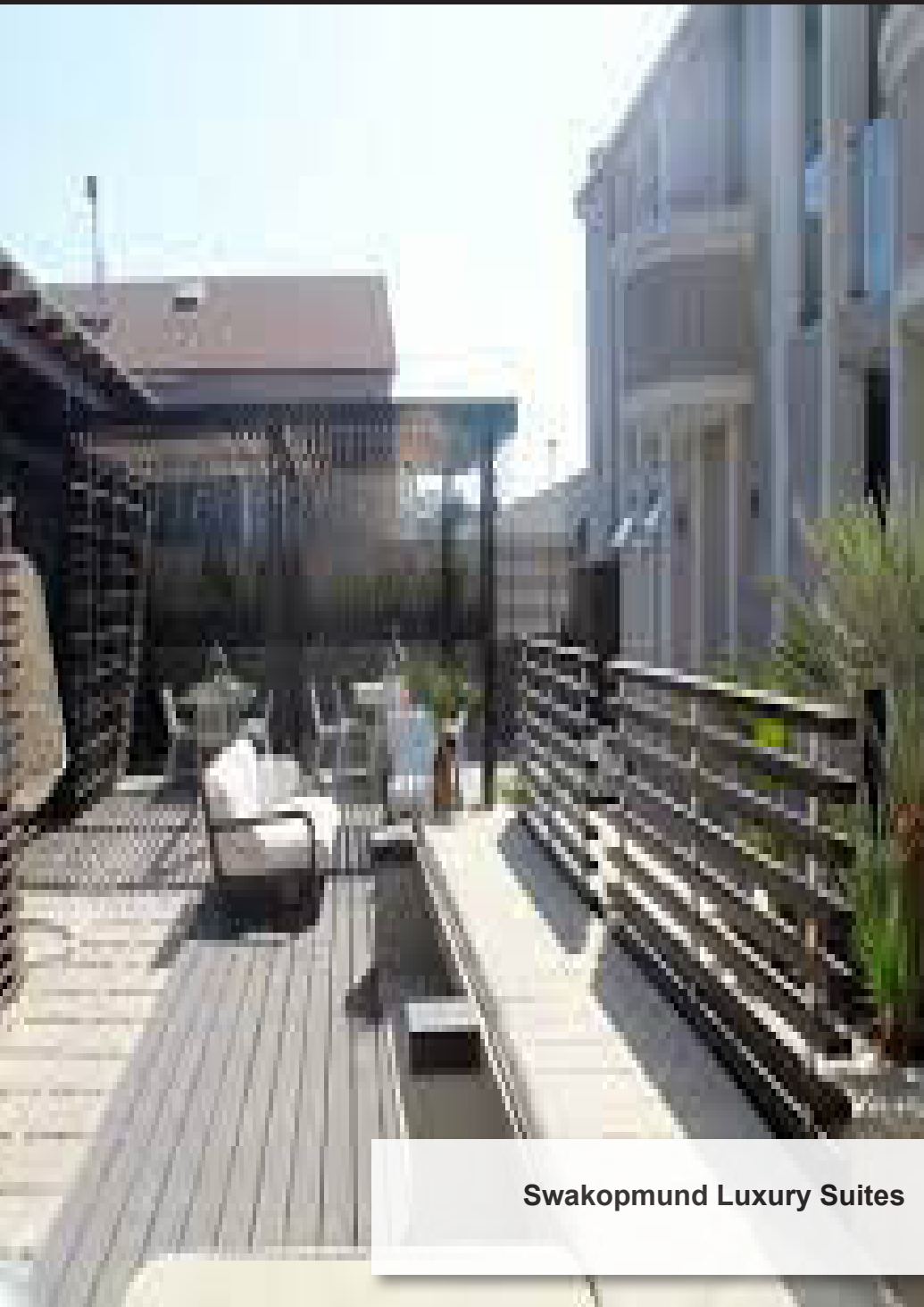
Swakopmund Luxury Suites